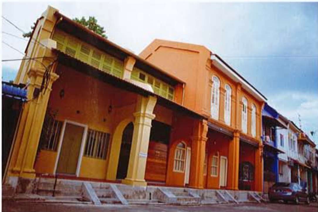
RIGHT Cheery orange and yellow with lime green accents are part of the warm welcome. Although the façade has been restored to its original form, the colours create a contemporary look and feel