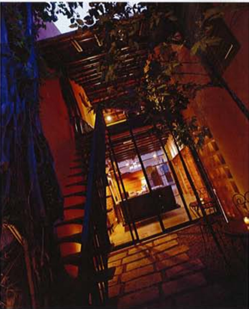
BOTTOM By day or by night, the courtyard with its cosy seating and greenery is a welcoming spot