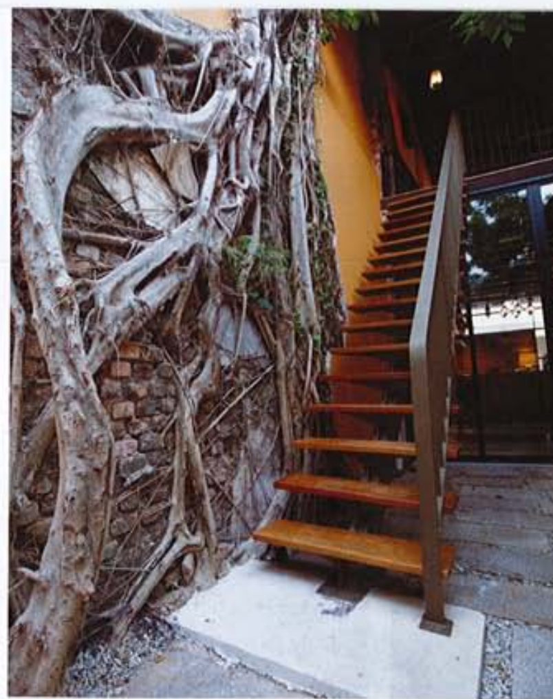
LEFT The lovingly maintained Bodhi tree keeps visitors company on their way up the stairs, providing a living piece of history that connects the former state of the lots to its present incarnation

Deviating slightly from the conventional Peranakan theme, Spices Residence also features design elements from Moroccan and Indian Muslim influences in the furniture and lighting fixtures,