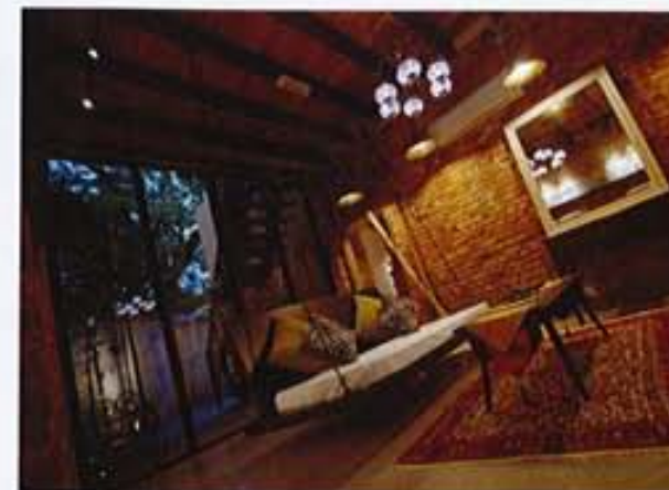
BOTTOM The library resembles a relaxing reading room, with an inviting exposed brick wall and terracotta tile flooring perfect for lounging with a good book