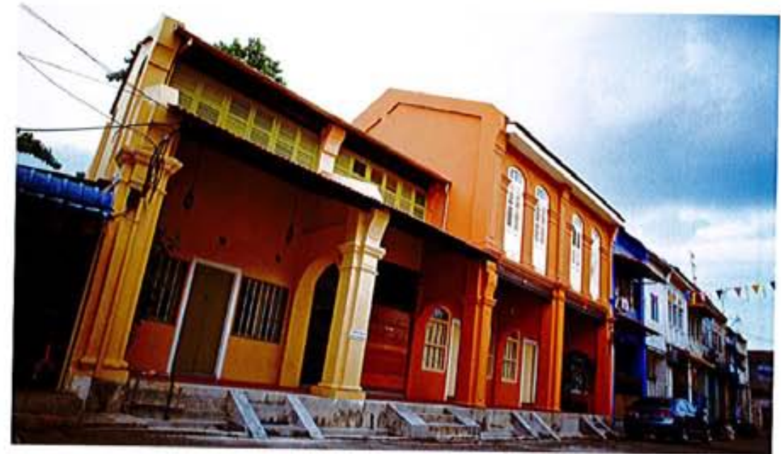
FACING PAGE; LEFT Cheery orange and yellow with lime green accents are part of the warm welcome. Although the façade has been restored to its original form, the colours create a contemporary look and feel.